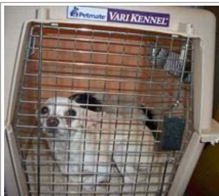
One of 4 dozen dogs rescued from Pike County Animal Shelter in KY.