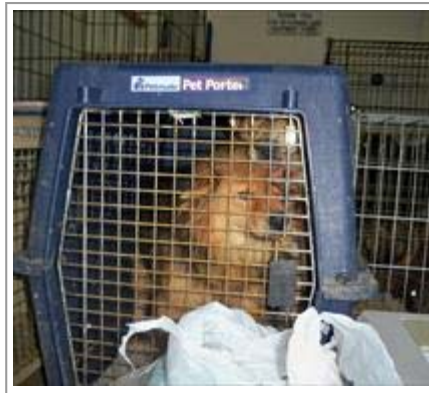
Rescued Dog From Pike County, KY Waiting To Be Unloaded At SAAP (SAAP)

They are also looking for volunteers to help with the animals. If you would like to help SAAP with their rescue of four dozen dogs, you can call the Pet Adoption Hotline at (859) 391-1234.